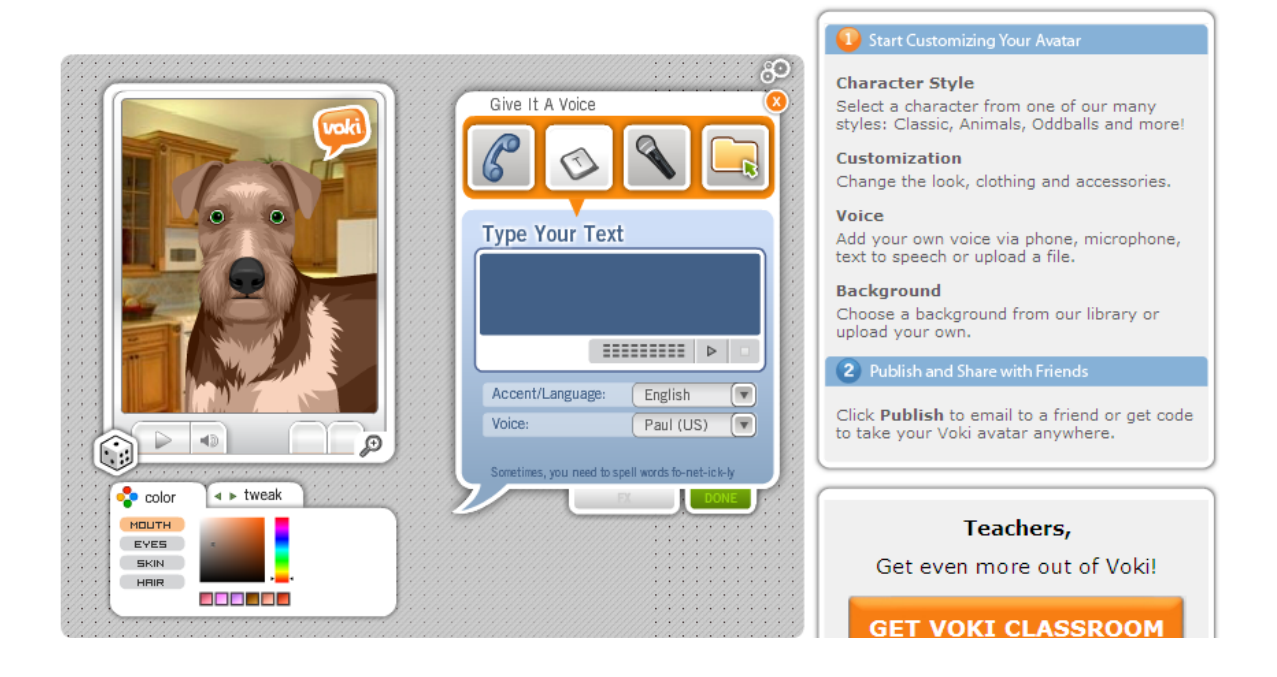
Step 6: Click Publish to save your Voki-give it a name you will remember.