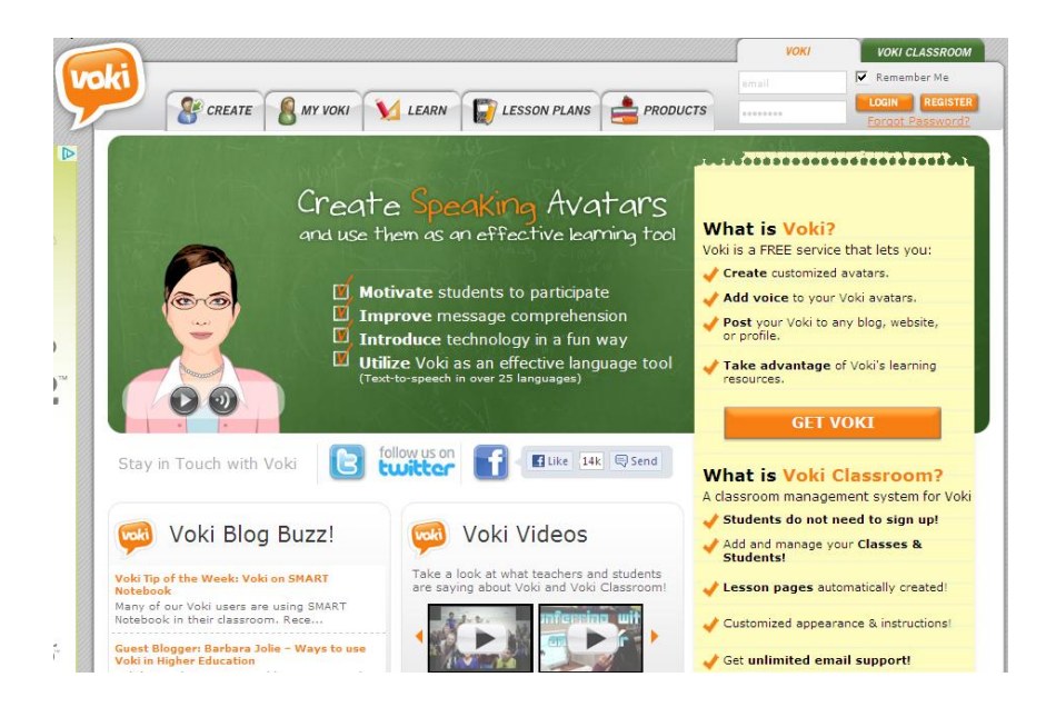
Step 2: Create a character